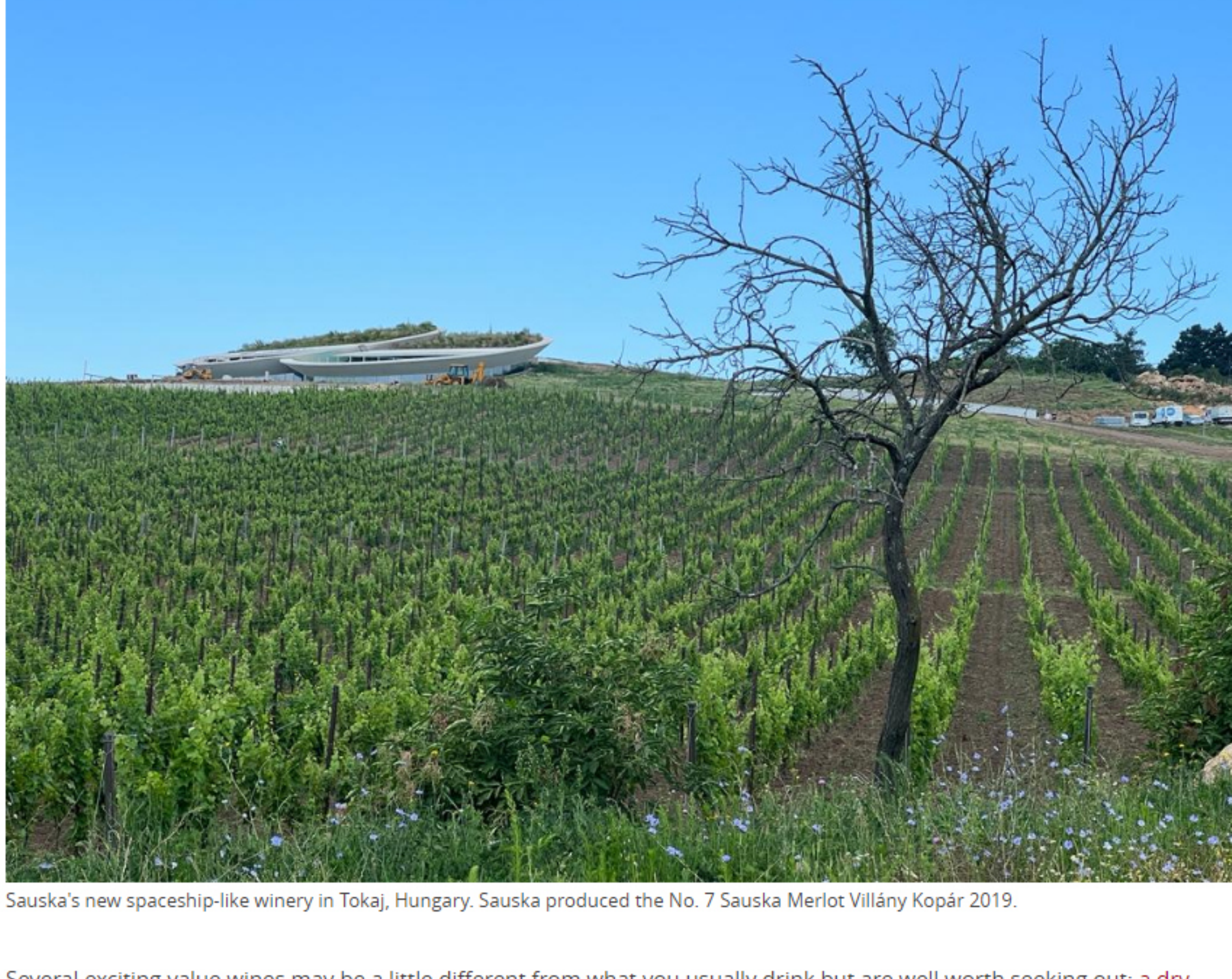
Sauska's new spaceship-like winery in Tokaj, Hungary. Sauska produced the No. 7 Sauska Merlot Villány Kopár 2019.

Several exciting value wines may be a little different from what you usually drink but are well worth seeking out: a dry German muscat at No. 11, produced from 50-year-old vines; a tawny port at No. 54; perhaps the best ever Chilean petit verdot at No. 39; and skin-contact wines like a Slovenian bottling at No. 36 as well as the Nos. 47, 53 and 67 bottles.