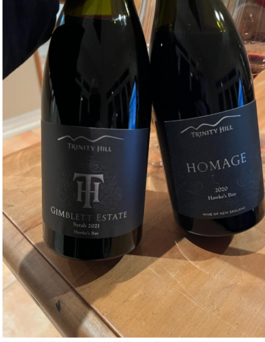
Trinity Hill's Gimblett Gravels (left, with Trinity Hill's Homage) is one of 18 New Zealand wines on our Top 100 Value list.

We love a serious chardonnay and even more so when it can be found at under $30, like the No. 6 El Enemigo Chardonnay Mendoza 2021. It's a flinty, phenolic and structured expression and it shows all the depth and minerality of a $100 Burgundian counterpart.