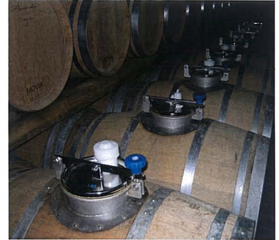
Custom-made Lunar barriques

Lunar is a revolutionary wine with minimal human intervention. This wine is the idea of innovative winemaker Aleš Kristancic, who wanted to create a wine that imitates the natural method of vinification which occurs in nature through the stages of the moon. To do so, Aleš created custom-made barriques, which allow for wine to ferment, age, and stabilize completely on its own. No grapes are pressed, it is without delestage, and no added chemicals are in this wine. To add to this unique process these barrels are then buried 25 feet underground and aged for nine months and bottled on its lees. Lunar is a true expression of a visionary winemaker.